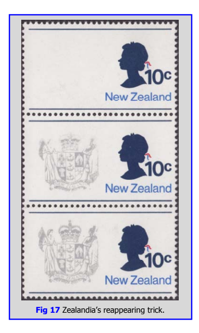
Figure 17 shows Zealandia's magical reappearing trick in a vertical strip of three, 10c no watermark 1973 definitive stamps: topmost stamp shows missing silver colour (Coat of Arms), centre stamp with partial missing silver colour, and the lowermost is normal with Zealandia at the left.

First appearing on multiple NZ and star watermarked paper this stamp was reissued in mid-1973 on unwatermarked paper. Many varieties can be found not only of the 10c stamp but also with the rest of the 1970/76 pictorials: imperforates, missing colours, and offsets.