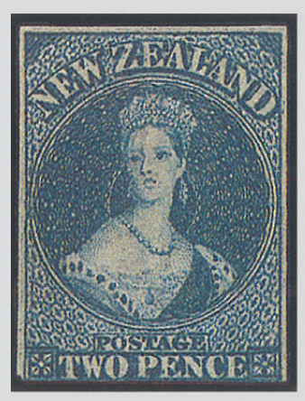
Lot 215 SG 2 Est $10,000