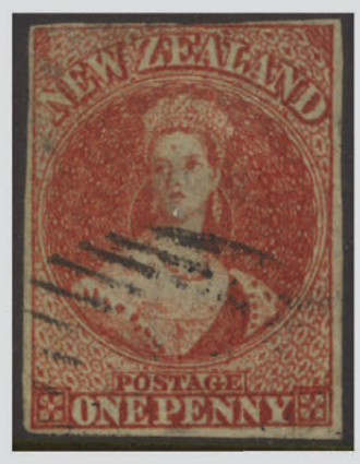
Lot 214 SG 1 Est $12,000