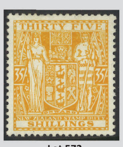
Lot 572 35/- Arms Est $6,500