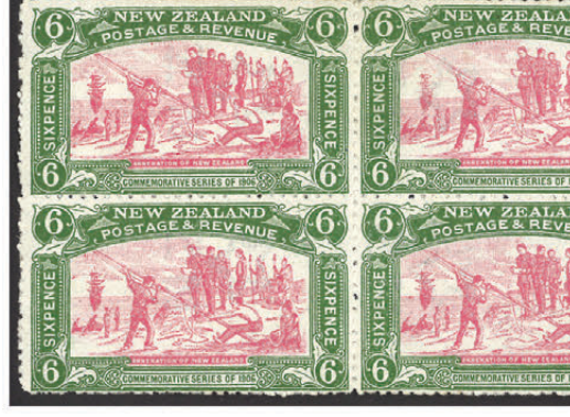
Ex 445 Ex 446 447 Ex 449