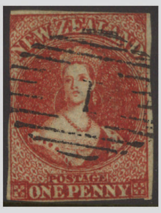
Lot 213 SG 1 Est $8,000