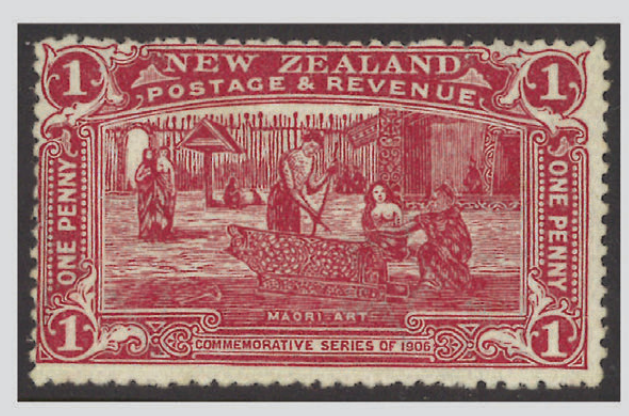
Lot 447 1d Claret Est $15,000