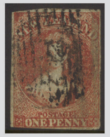
Lot 212 SG 1 Est $5,000