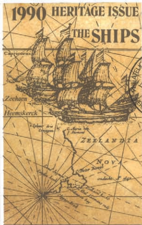
NEW ZEALAND POST FIRST DAY COVER