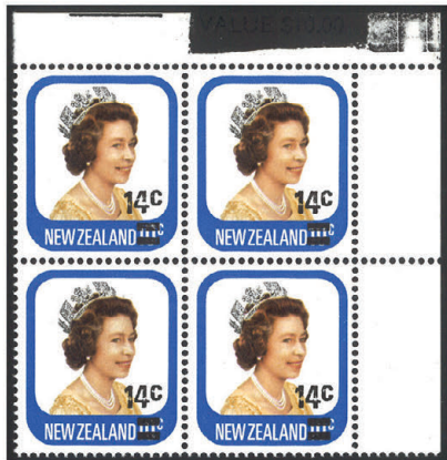
963 - image reduced