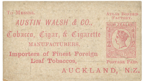
560 - image reduced