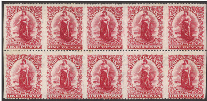
720 - image reduced