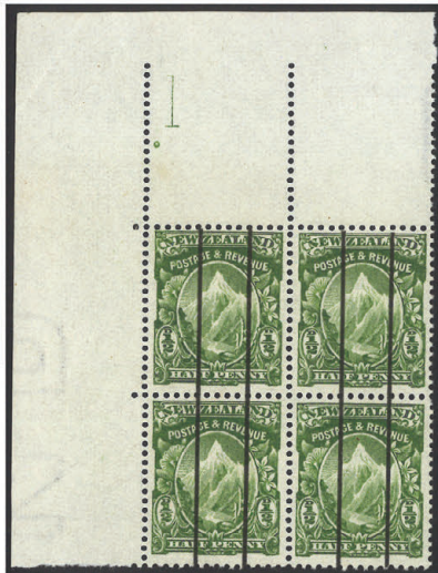
724 - image reduced