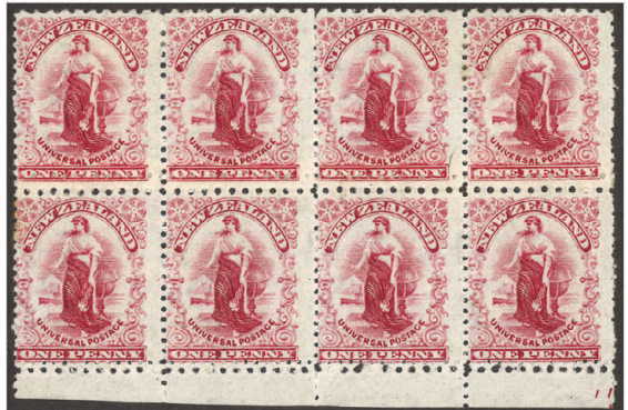
716 - image reduced