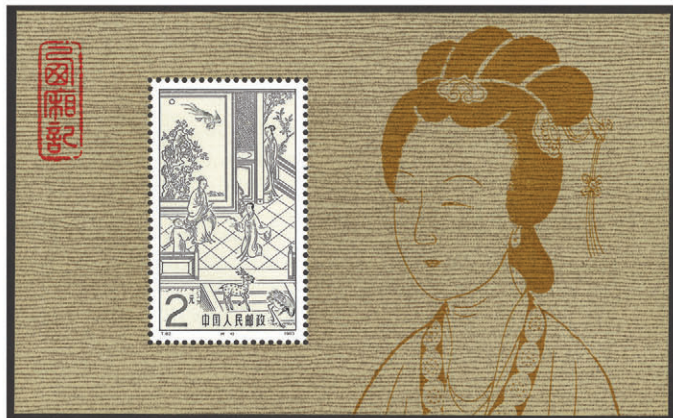
3364 - image has been reduced in size