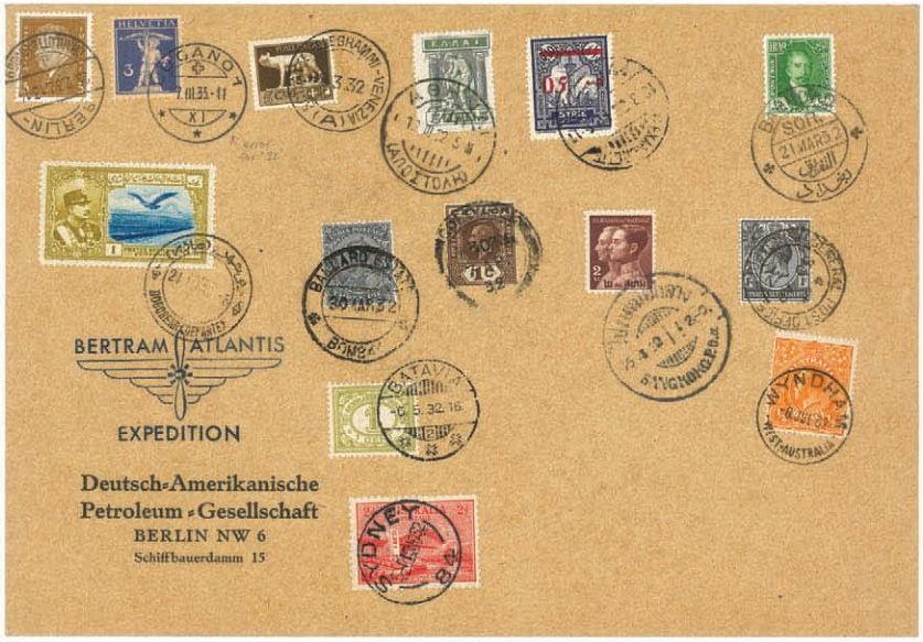
192 image reduced