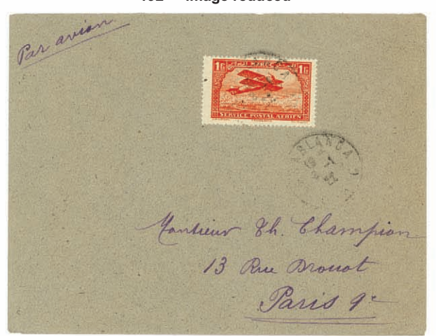
192 image reduced