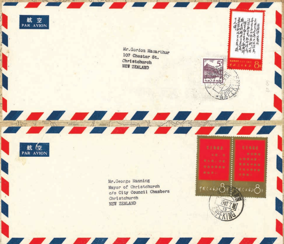
Lot 3410 - Image reduced by 50%